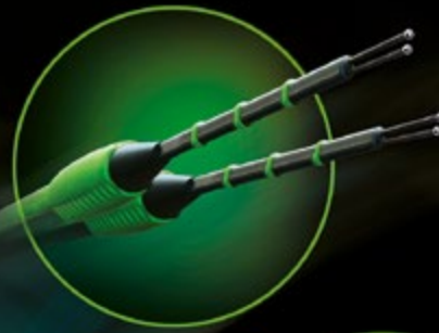
Disposable Handheld Probe