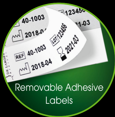
Removable Adhesive Labels