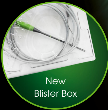
New Blister Box